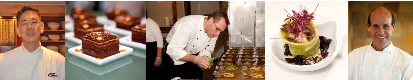
2010 LEGG MASON TENNIS CLASSIC presented by GEICO

Tickets include food and drink during the reception and a ticket to the tournament on Monday, August 2. Availability is limited, so call the Tournament Hotline at 202-721-9500 or return the below order form to reserve your spot.